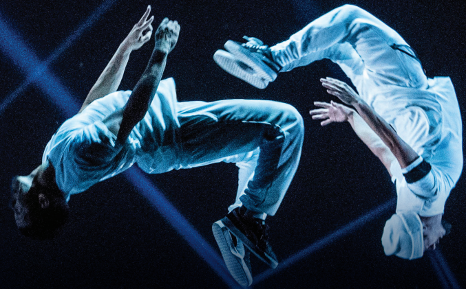
The Hip Hop Nutcracker with MC Kurtis Blow | 2 & 7PM

buy tickets at njpac.org or at the box office starting at 12PM!