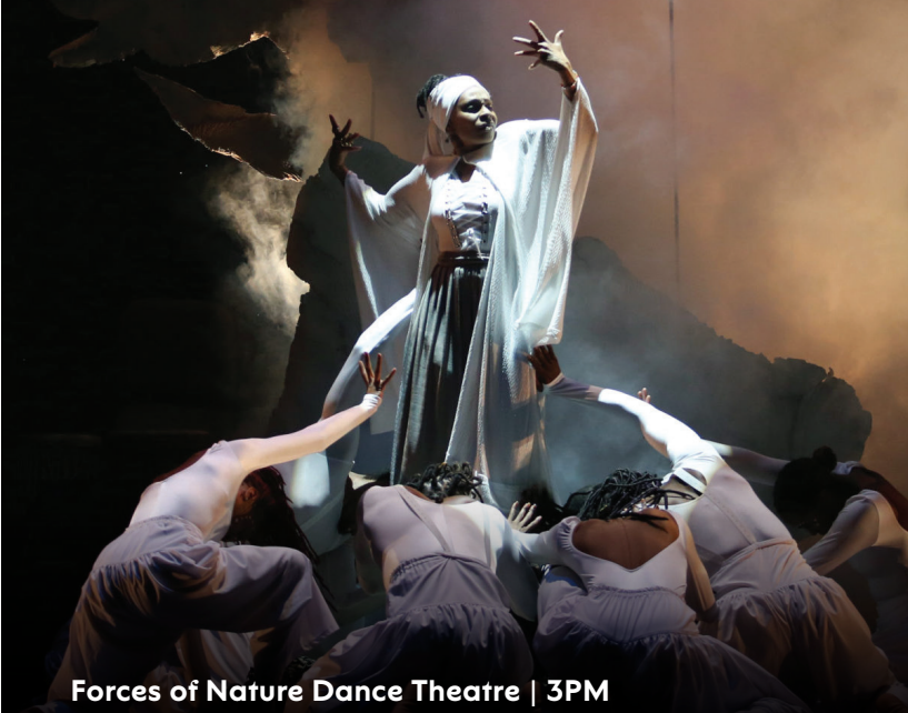
Forces of Nature Dance Theatre | 3PM